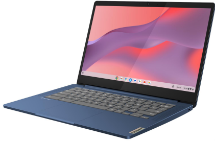
Powered by MediaTek Kompanio