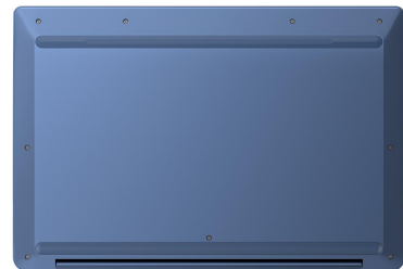
Powered by MediaTek Kompanio