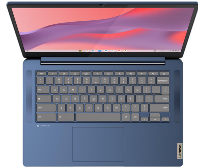
Powered by MediaTek Kompanio